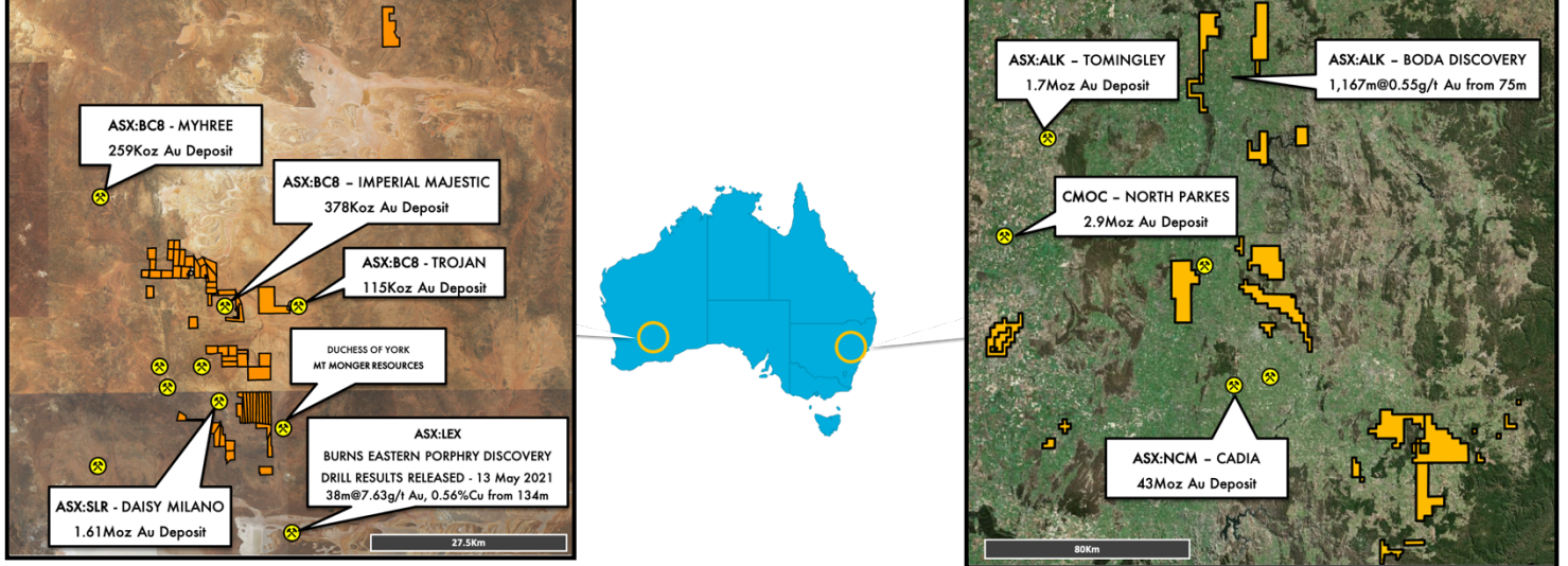
Figure 1 - Orange tenements in NSW & WA

This ASX announcement has been authorised for release by the Board of Orange Minerals NL.