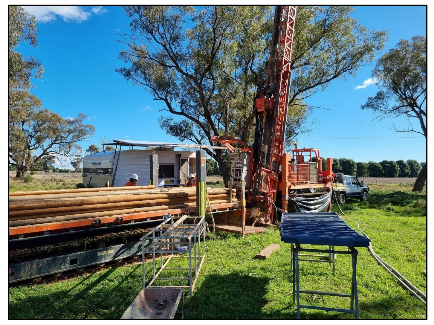
Figure 2 - Diamond drill rig set up on first hole (OCDD001)