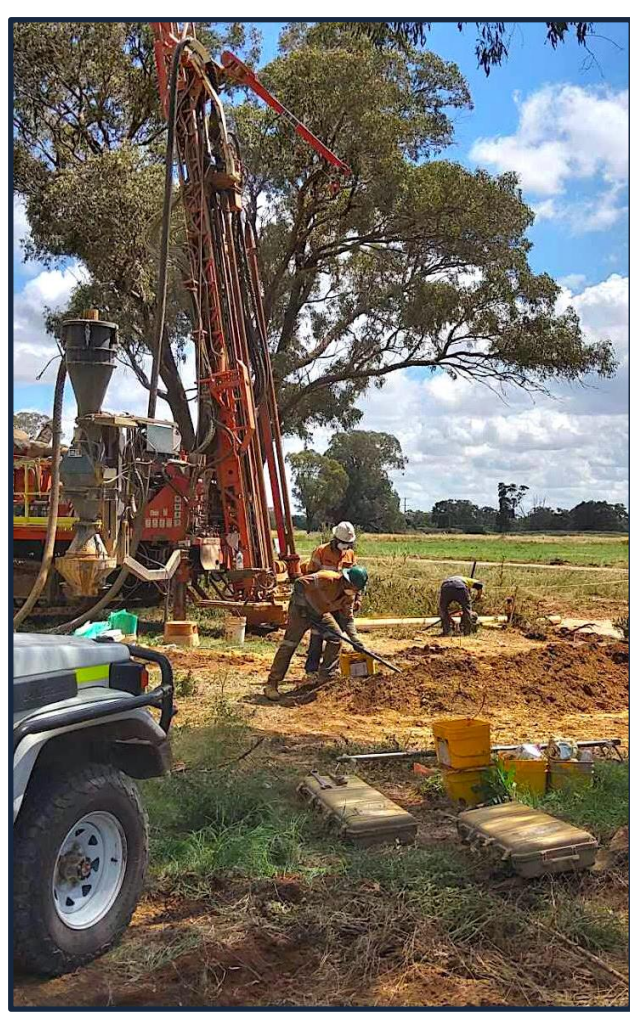
Figure 1 - Orange Minerals Drilling at Calarie.