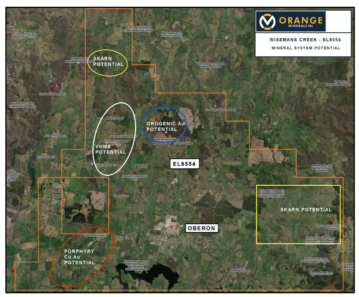
Figure 1- Mineral System Potential – Wisemans Creek EL8554

An initial drill programme on the Wisemans Creek tenement is planned in the short term, subject to receiving all the necessary approvals.