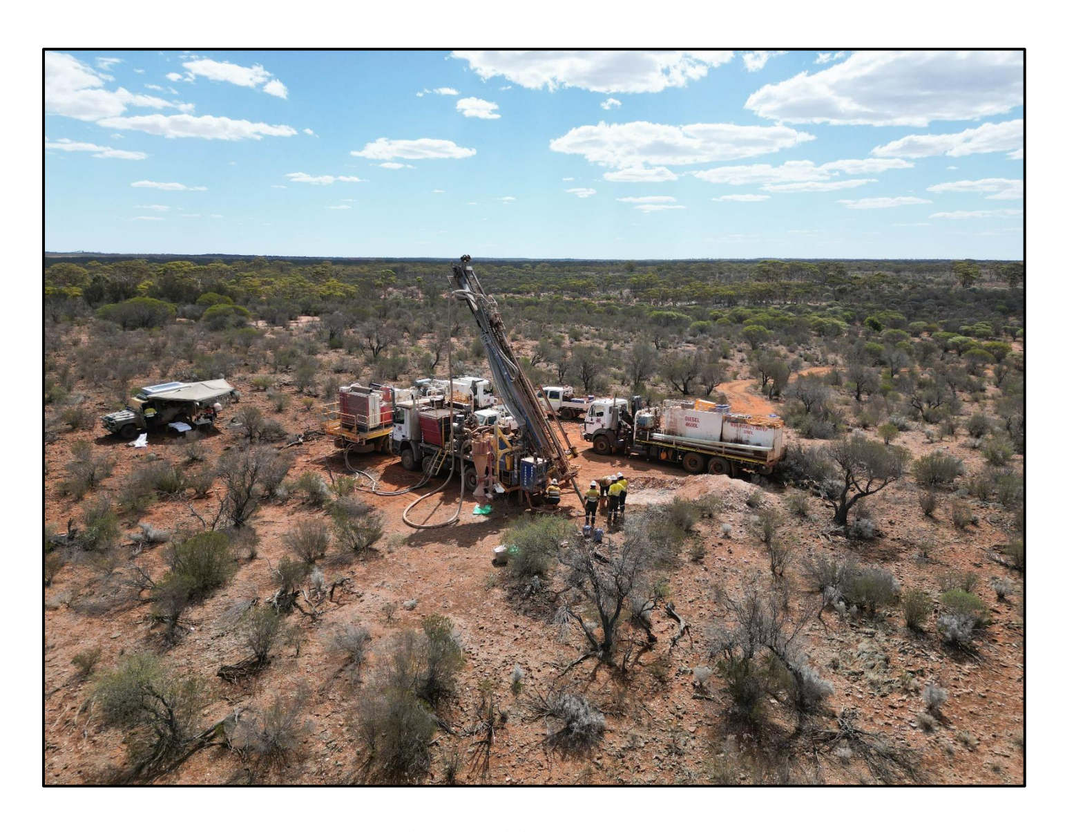
Figure 1-RC drill rig at Burton Dam WA