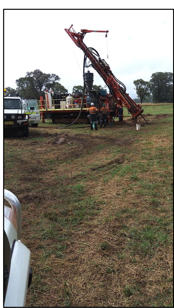
Figure 1 - Orange Minerals Drilling at Calarie.

"The Phase 1 drill program at Calarie was executed efficiently & timeously and credit is due to all parties involved. RC samples have been dispatched to the lab and we very much look forward to receiving the assay results, which are expected to be received in February next year."